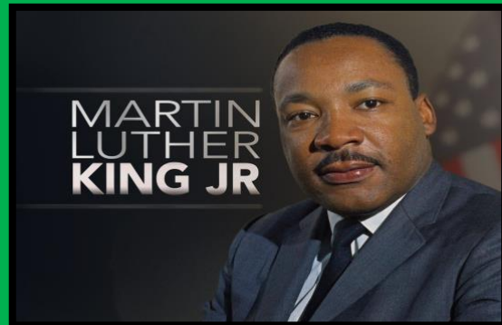
Martin Luther King Jr.

The 1 st African American Female Astronaut.