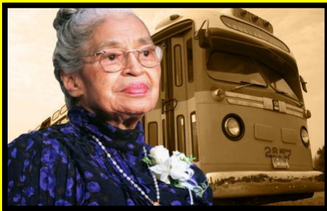
Rosa Louise McCauley Parks

An American civil rights activist, whom the United States Congress called "the first lady of civil rights" and "the mother of the freedom movement".