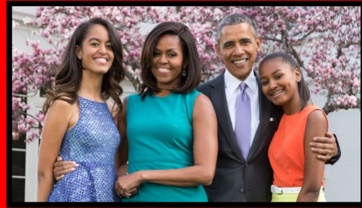
President Barack Obama The 1 st African American President

Black History Month is an annual celebration of achievements by African Americans and a time for recognizing the central role of blacks in U.S. history